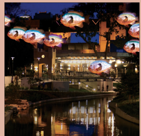
The new River Walk Museum Reach features native landscaping and dazzling public art.

DISCLAIMER The City of San Antonio does not guarantee the accuracy, adequacy, completeness, or usefulness of any information. Individuals assume all risk and responsibility.